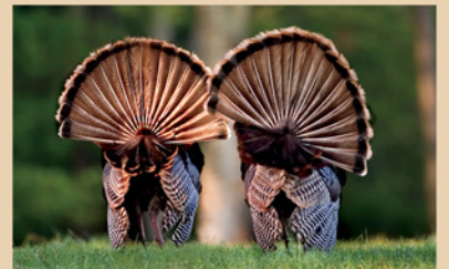
2013 Mississippi Sportsman License